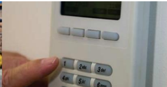
Proximity & Smart Card Reader